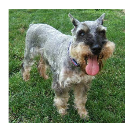
On June 23<sup>rd</sup> Barb Littler's little foster girl Emmy passed away and is with all of our little angels at the bridge. She was lost to cancer.