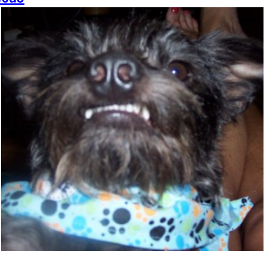
Zippy enjoys showing off his best star smile and his pearly whites!

http://www.theanima Irescuesite.com/clickToGive/photostory.faces?siteId= 3&storyTag=g9h3m3n2xd rr3jyie6u8